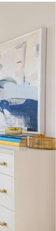
1. Short Wide Foundation Vase in Amber, West Elm. 2. Green and Blue Coastal Pillow by Nautical Nell, Etsy. 3. Mercer Dresser, Serena & Lily. 4. Dalmatian Spots Wall Hanging, Society6. 5. Kenitra Gold Arch Mirror, France & Son. 6. Canary Yellow Matte Velvet Curtains by Pattern Homes, Etsy.