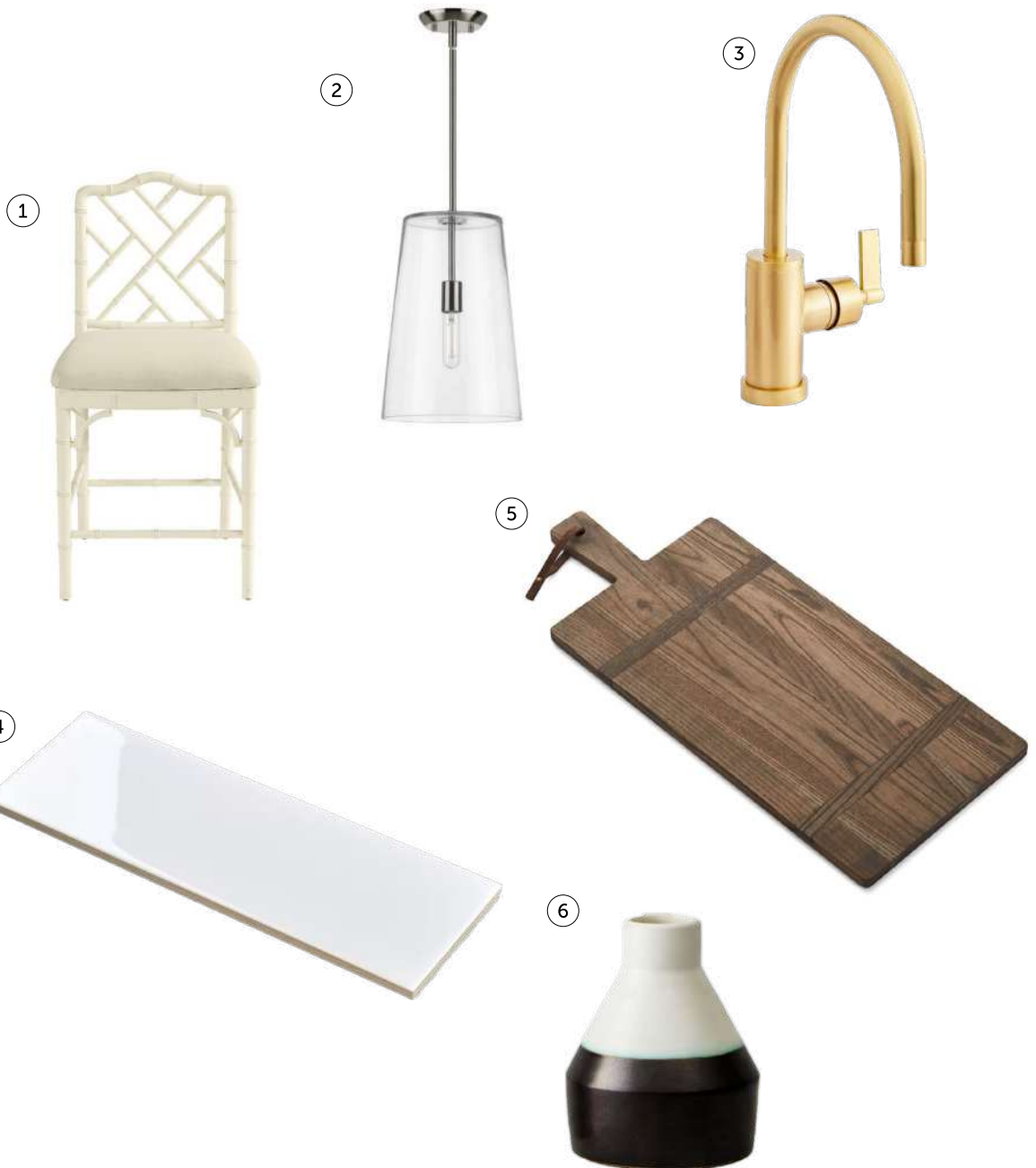
1. Dayna Stools, Ballard Designs. 2. Clarion Pendant in Satin Brass Finish & Clear Glass, Progress Lighting. 3. West Slope Lever Handle — Single Hole Kitchen Faucet in Aged Brass, Rejuvenation. 4. Hudson 4" x 12" Ceramic Subway Tile by Walkon Tile, Wayfair. 5. Heritage Small Serving Board by J. K. Adams, Crate & Barrel. 6. Shape Studies Ceramic Bud Vase, West Elm.

Eclectic style creates harmony through the juxtaposition of colors, textures and styles, resulting in a creative and cohesive space that shows off your unique personality while still feeling curated. At our Paintbox model home in Kirkwood, design director Courtney Rogers paired cool finds with colorful pieces to pull together a charming and cheerful home that's one-of-a-kind. Discover the must-have furniture and accessories needed to recreate this spirited style in your own home.